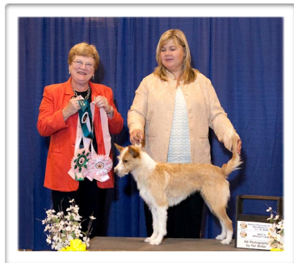
Ursa de Retrouvaille