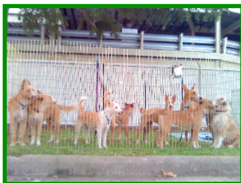
Medios and Grandes relaxing & socializing behind the hotel.