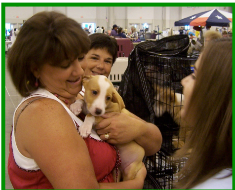
The public enjoyed meeting the podengos, especially Diana's litter of 11 smooth Grandes.